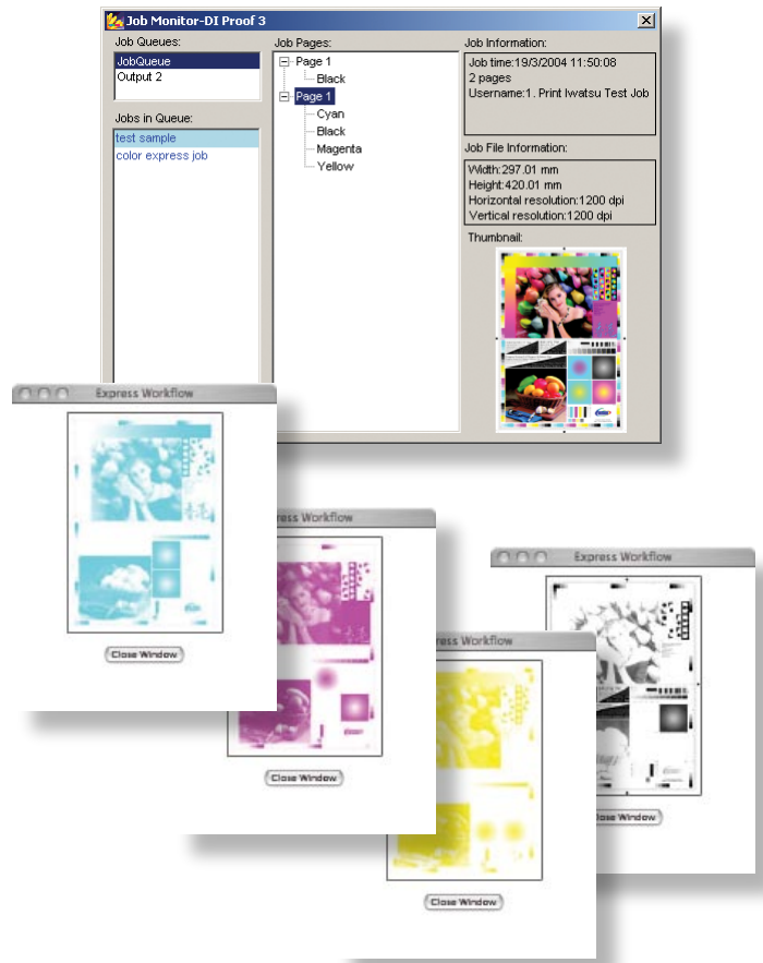
DI Proof's Job Monitoring gives clear feedback on work in the queue.

Windows 2000 Professional or Server, Windows 2003 server.